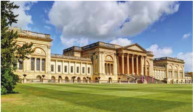
Stowe House and Landscaped Gardens